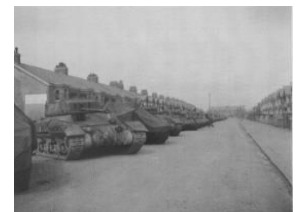
Navarino Road in 1944

Navarino Road first appears on the Ordnance Survey map of 1896 and house building commenced at the turn of the century.