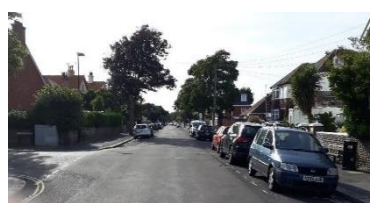
Church Walk today