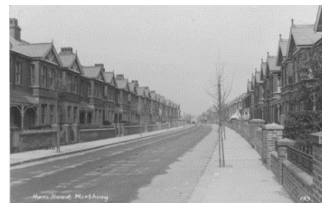
Navarino Road in 1920