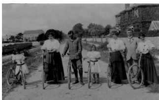
Church Walk in 1895

Church walk which connects Ham Road to St. Georges church was built and Navarino Road was constructed on the site of a footpath which gave access to the market gardens that existed around the mills.