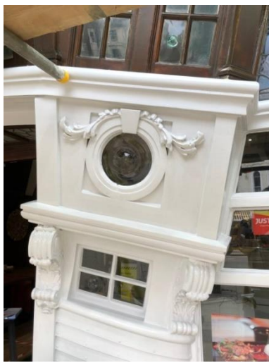
Issa Sushi, 31 South Street, Worthing

I am pleased to report that our liaison with the Planning Enforcement Team has continued so as to progress our Campaign upgrading the South Street Conservation Area. Heritage buildings in good order can contribute to our 'visitor economy'. Adding to our successes in Bedford Row and the Montague Street area, I am pleased to report that two heritage buildings in South Street have been redecorated - the 'Grape Tree' (a Victorian building occupying a landmark corner site) and the redecoration, after several years, of the sushi bar with the pirate figure atop in the crow's-nest.