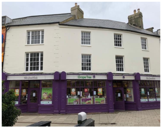
Grape Tree, 56 South Street, Worthing

LCAS are also invited to comment on Planning Consultations where we can give informed, constructive views at an early stage to possibly bring about an improved design. My colleagues also have a constructive liaison with the Conservation Officer and the Council's Conservation Areas Advisory Committee. Our next challenge will be to examine the new Planning White Paper and the possible effect on our heritage assets. Busy times ahead but I have every confidence in our dedicated team.