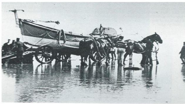
The Richard Coleman and its heavy transporting carriage on the sands, preparing to launch at low tide.

The launches were often attended by large crowds when news of a vessel in trouble circulated through the town. Reference material shows that the Worthing and West Sussex coastline experiences difficult currents and sudden shifts in the seabed resulting in shipwrecks and many similar incidents. This makes the heroism of these local fishermen and crews even more poignant. The lifeboats were taken to the launching site east of Worthing Pier by a team of six strong horses and launched from the beach.