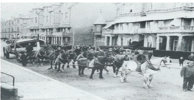
The Richard Coleman horse and crew on the seafront road, and ready for action. Taken by P. J. of Brighton for publication in the Navy and Army Illustrated, this photograph clearly shows the little Victorian lifeboat house, with its turret window open, nestling between two attractive four-storey, 18th century terraced dwellings.

Their heroism is exemplified by the tragedy of the "Lallah Rookh" disaster of November 1850. It is perhaps Worthing's best known maritime tragedy. During a violent storm the barque "Lallah Rookh" was in severe distress. The fishermen launched open boat from the beach but tragically before it could reach the crew of the stricken vessel life boat capsized. All eleven crewmen perished. Most were family men and left widows with young children. A fund was set up by local dignitaries and raised £5000 for the families of these heroic men. There is a Memorial at St Mary's Church, Broadwater.